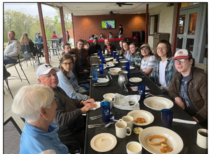
The audio visual team and the praise band enjoyed an end-of-the year celebration at Traditions last week.

All church members, especially those on leadership committees, are encouraged to attend.